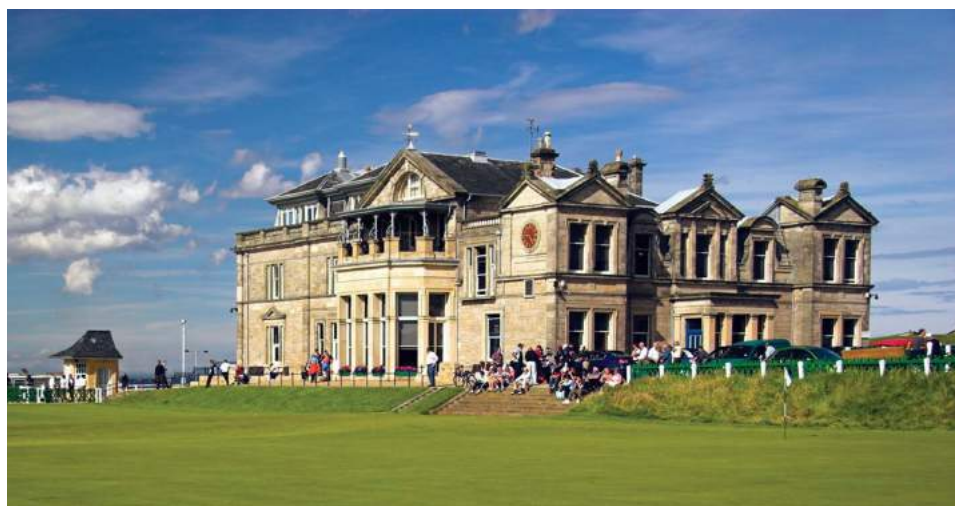
The Royal and Ancient Golf Club of St Andrews