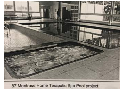
87 Montrose Home Therapeutic Spa Pool project

Our major project was to provide financial assistance to Montrose Home for Crippled Children (which our club has been instrumental in founding many years ago) in building a heated therapeutic pool complex. We gave $20,000; the work was finished and the complex opened in late 1987.