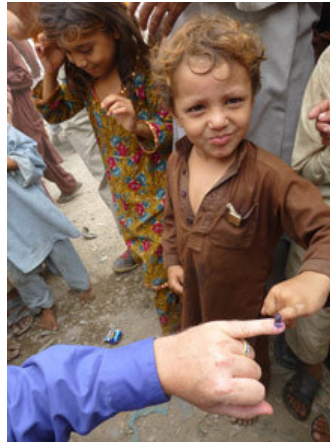
A boy has his pinkie marked to indicate he has received the polio vaccine.

I am proud to be a member of Rotary, one of the largest volunteer organization in the world. With your help, we will win the fight against polio.