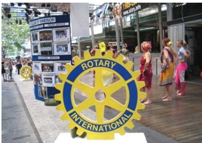
Conference Happy Snaps Images of Rotary display in the Queen St Mall. Part of the Conference publicity.